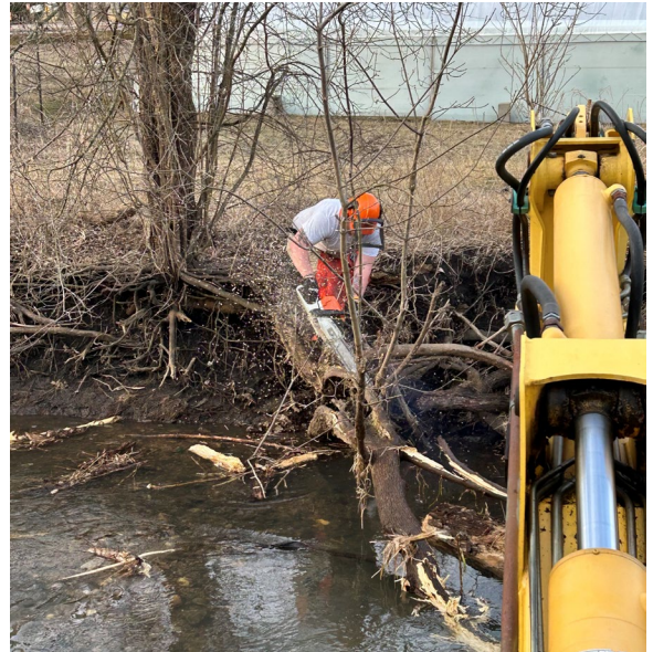
Staff clearing trees in creeks last month.

In between the amenity preparations, staff wrap up winter trimming projects aimed at reducing vegetation encroaching on trails, minimizing the time requirements to keep trails accessible all summer long. Some brush and vegetation are removed from intersections to improve visibility for vehicles and bicycles operating around preserve entrances and critical trail crossings.