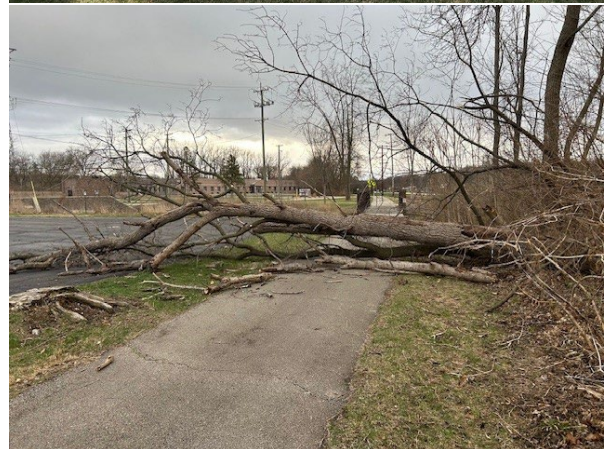
Storms last month caused several trees to be downed, above are Muirhead (first photo) and Fox River Trail (second photo).