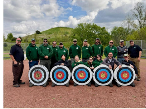
Staff across multiple departments completed training to become certified archery instructors.

Required District trucks and trailers passed Safety Test Lane inspections at KDOT. This is a state mandated inspection to