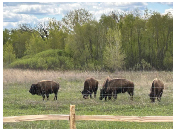
Bison grazing on the prairie at Burlington FP.