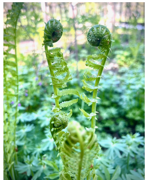
Young fern tendrils sprouting out at Fabyan FP.