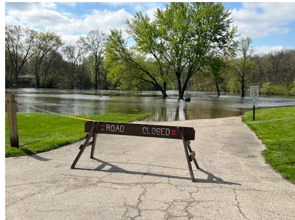
Closures due to the Fox River flooding at Buffalo Park FP.

May 1st marked opening day for the 2026 camping season at Paul Wolff and Big Rock Campgrounds. Staff worked to make sure camping sites were cleaned, picnic tables distributed, saturated lawns were mowed, electric and water service were turned on and tested, and attendant staff were trained.