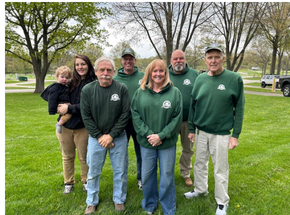
The 2026 campground crew is ready to welcome visitors to Paul Wolff.