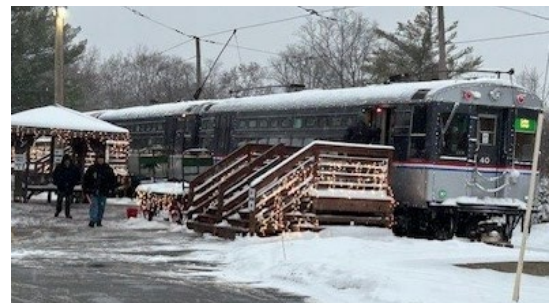
The 2025 Polar Express kicked off last month at Jon Duerr FP.