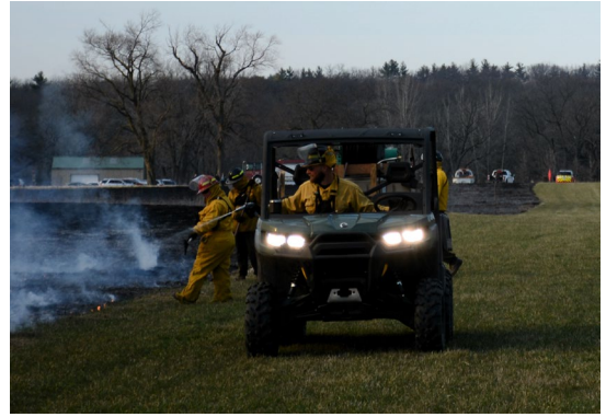
One of the carts utilized during prescribed burns that is maintained by fleet crew.

Operations staff have been busy behind-the-scenes with the bison project at Burlington Forest Preserve. New and additional signage was created for the enclosure to warn the public about safety surrounding the area of the fence area and a shed was constructed for storage of needed supplies.