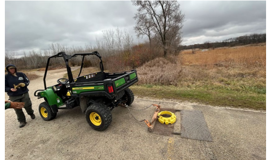
Staff preparing a cart to grade trail surfaces.

Regular vehicle and equipment services and repairs continued in November. Utility carts were the main focus for Fleet this month. End of the season annual inspections and services have been completed for South Operations and Natural Resources; with North Operations equipment slated for early December. Cart inspections and services include tire evaluations, suspension checks, electrical diagnostics, drivetrain repairs, cooling system services, axle