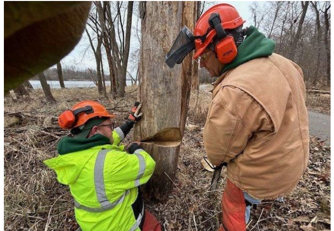
Rangers Kenney & Uidl reviewing cutting techniques.

Drafts of the Japanese Garden have been completed for future coniferous additions. While adhering to Traditional Japanese Gardening