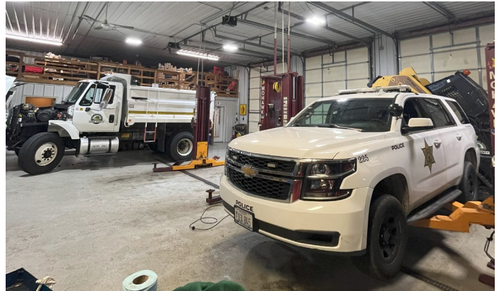
Photo from inside the fleet's bay.