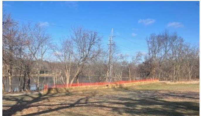
Snow fencing installed at Fabyan FP east side, ready for winter activities once snow falls.

Staff took advantage of the mild weather in December to complete some annual and introductory chainsaw training. Each year staff undergo a variety of cutting skills trainings to ensure they are safe while working but also improve their ability to remove trees along heavily used trails and roadways and make good decisions about protecting infrastructure on District property. All operations staff participated in a classroom refresher on PPE and