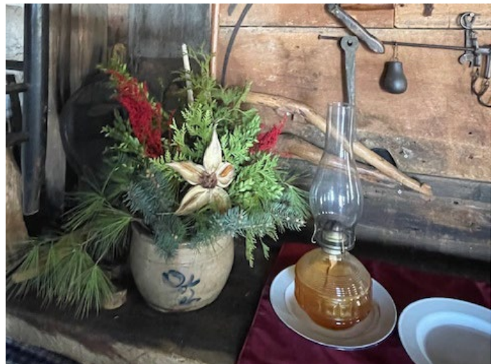
Evergreen cuttings prepared by the horticulturist for the Durant House Candlelight Event.