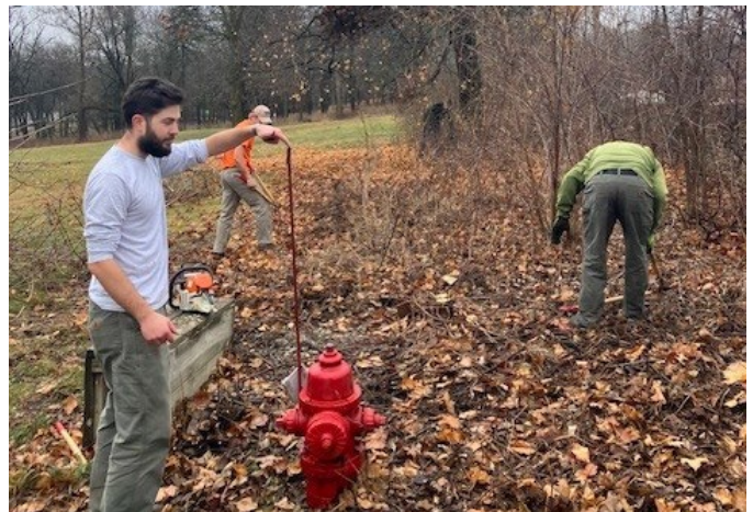
Staff clearing brush and debris along the Fabyan FP wall that stretches from the west gate entrance up north past the Villa.