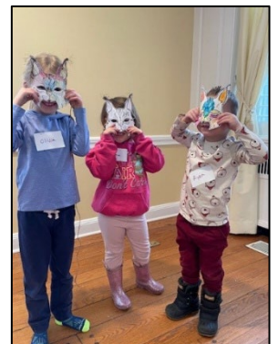
Look out for Bobcats! "Little Saplings" students learn about the natural world using all five senses and creative play.