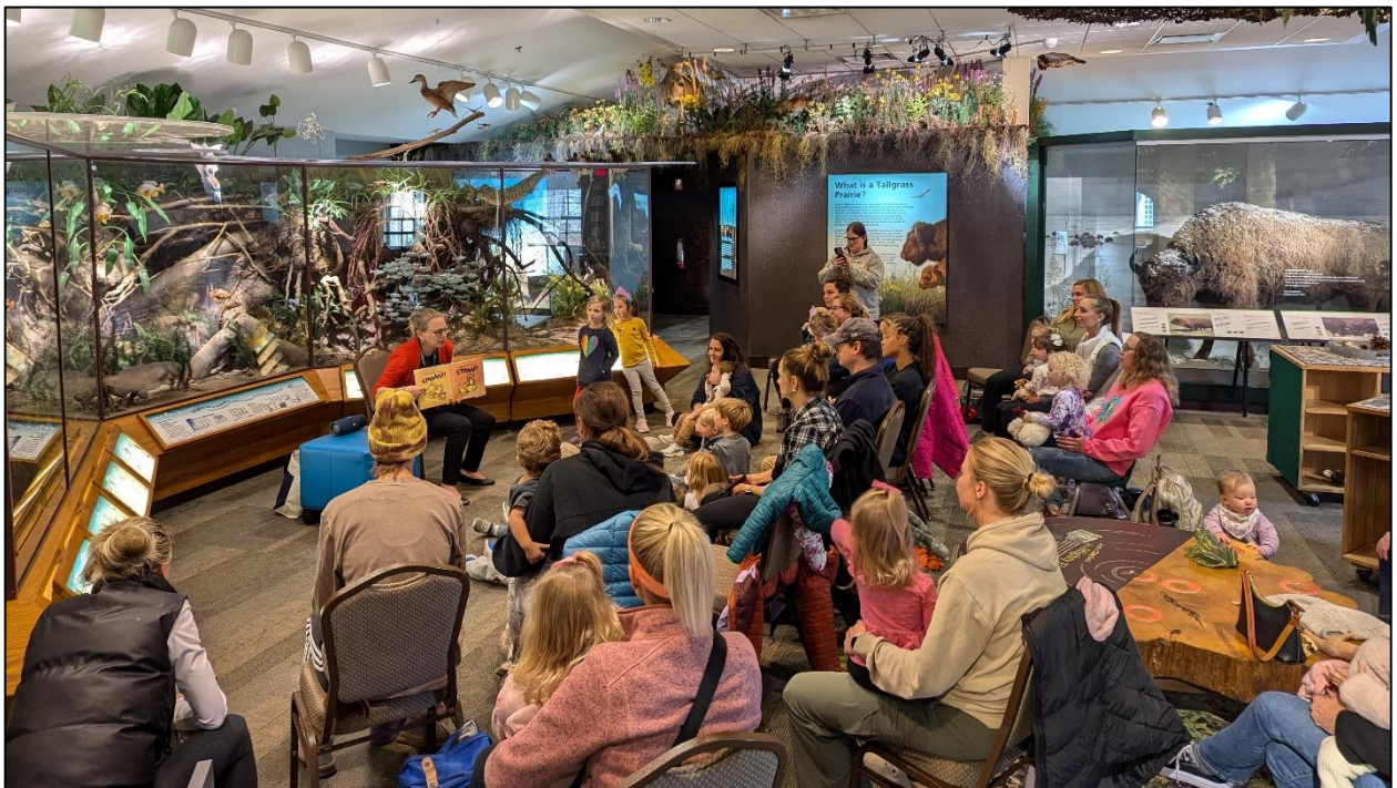
There was standing-room only during this month's Storytime at Creek Bend Nature Center.

PUBLIC PROGRAMS – Our monthly Storytime at Creek Bend Nature Center always draws a crowd, but November was especially popular. Partners from the St. Charles Public Library shared nature-themed books, games, activities and songs with 57 preschoolers and their families. After the program, patrons were invited to explore the nature center.