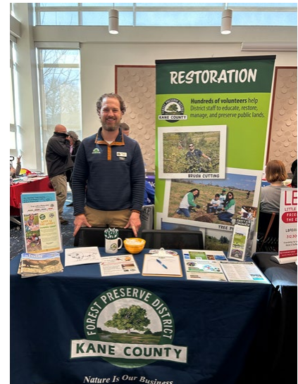
Tabling At Geneva Library