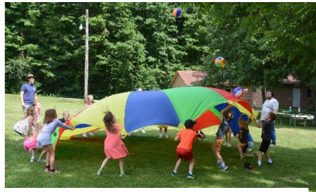
During Fun and Fit in Nature camp, campers thrived in the great outdoors.