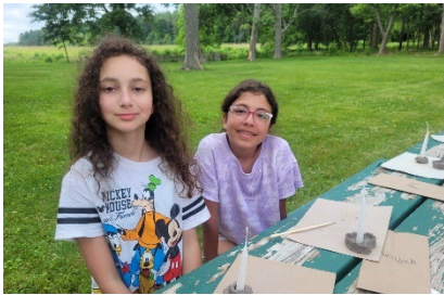
Art in Nature campers created nature-themed art in the perfect studio.

July Spotlight: That's a wrap on another successful Week in the Woods Summer Camp season! Over the summer, our team of naturalists and naturalist interns led five full weeks of nature-themed camps at LeRoy Oakes, Camp Tomo Chi-Chi Knolls, Burnidge and Johnson's Mound Forest Preserves, concluding with the Tools of the Trade camp in July. In total, 65 campers from ages 6-12, explored woodland wonders, got their feet wet in preserve streams and learned new skills. We are full of gratitude to have spent time helping to develop these future conservationists. July camps are pictured below.