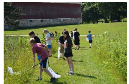
Middle schoolers learned naturalist skills during the Tools of the Trade camp.