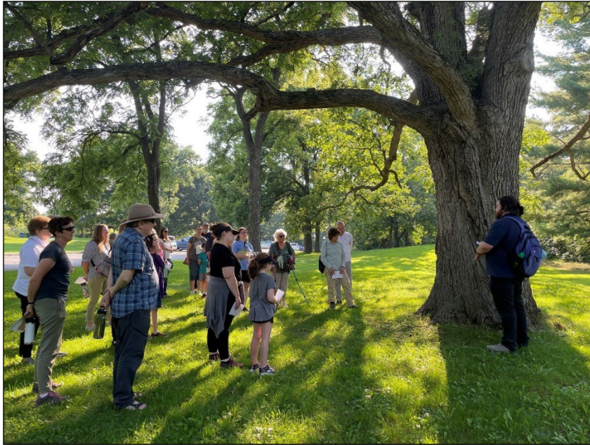
Patrons learned about fungi on the foray through LeRoy Oakes Forest Preserve's woodland and grassland trails.