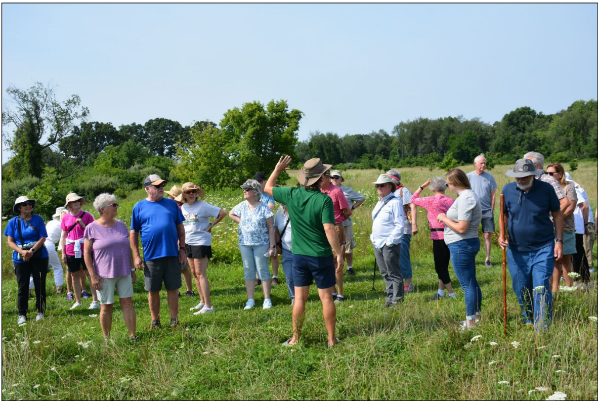
Seniors enjoy a leisurely stroll through the grasslands of Camp Tomo Chi-Chi Knolls.