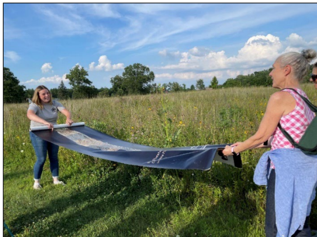
Folks were delighted to see a life-size depiction of the large root biomass of typical tallgrass prairie plants.

With the tallgrass prairie exploding in late-summer color and texture, Naturalist Intern Waldrop offered a Summer in the Tallgrass program at LeRoy Oakes Forest Preserve. She explained the history of tallgrass prairie in Illinois, then introduced the participants to the many species of flowers and grasses that are specially adapted to growing there.