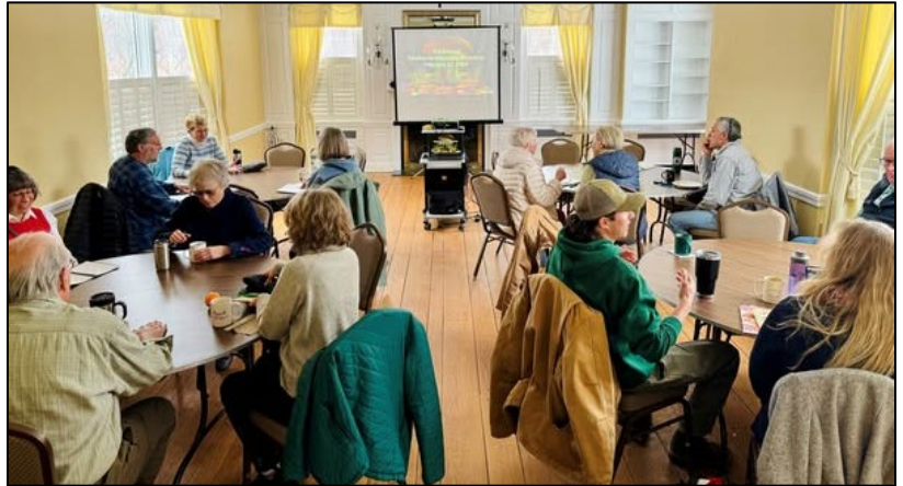
Mushroom Monitors shared stories about their fungal observations before the presentations began.