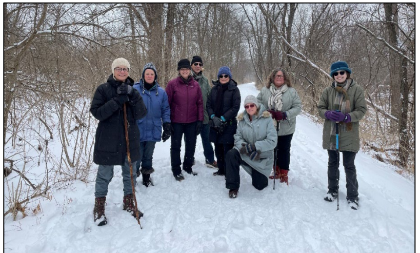
Wild Ones members enjoyed the snowy trails at Les Arends Forest