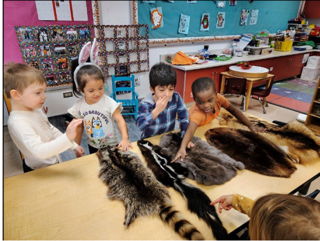
What Pre-K student can resist the lure of touching wildlife pets?